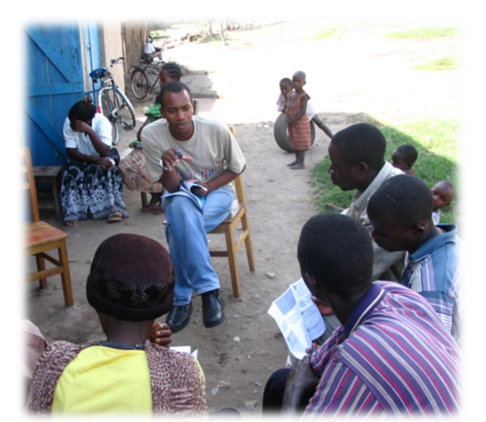
Photo: A mining official conducts a focus group with young women and men